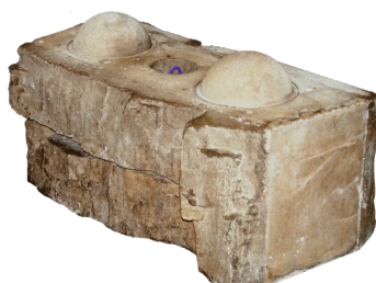
R002-A187-LD01 / LD02 42.5 in Curved Face Mold