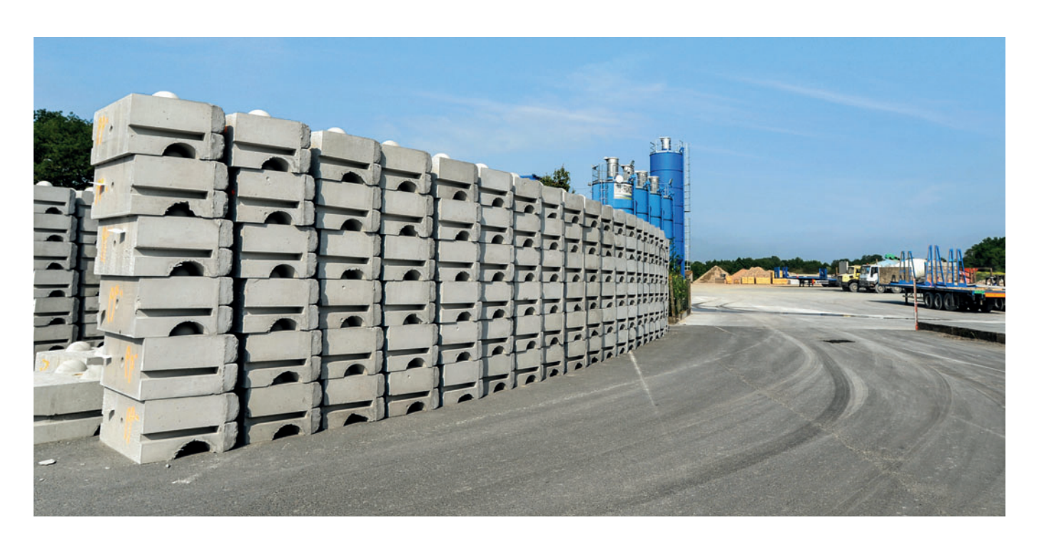
One benefit of the Redi-Rock system for Les Prefa Bressuirais is the product line can be inventoried, improving the ability to provide the large, precast modular blocks in a timely fashion to retaining wall customers.

Thus far, the process has had a ripple effect, not just with Redi-Rock projects leading to more Redi-Rock work, but also with more awareness of the other avenues of Les Prefa Bressuirais business. In total, PB Rock has completed 30 Redi-Rock projects since the beginning of 2018, averaging about two projects per month. The overall sales of the precast business has grown 50 percent since Fabrice took over the company. "Ten years ago, this company did 9,000 - 10,000 cubic meters