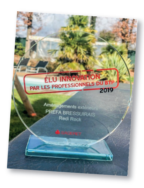
The 2019 L'Election des Produits du BTP award for the most innovative product in the landscaping category received by Les Prefa Bressuirais for Redi-Rock.

Redi-Rock International is part of the Aster Brands family of business opportunities whose purpose is "Changing the